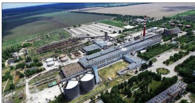
The history of the enterprise dates back over 40 years

The first sugar plant in Ukraine introduces an energy management system (EnMS) and certified in accordance with the requirements of the international standard ISO 50001. EnMS has helped to save more than $ 250,000 over 4 years.